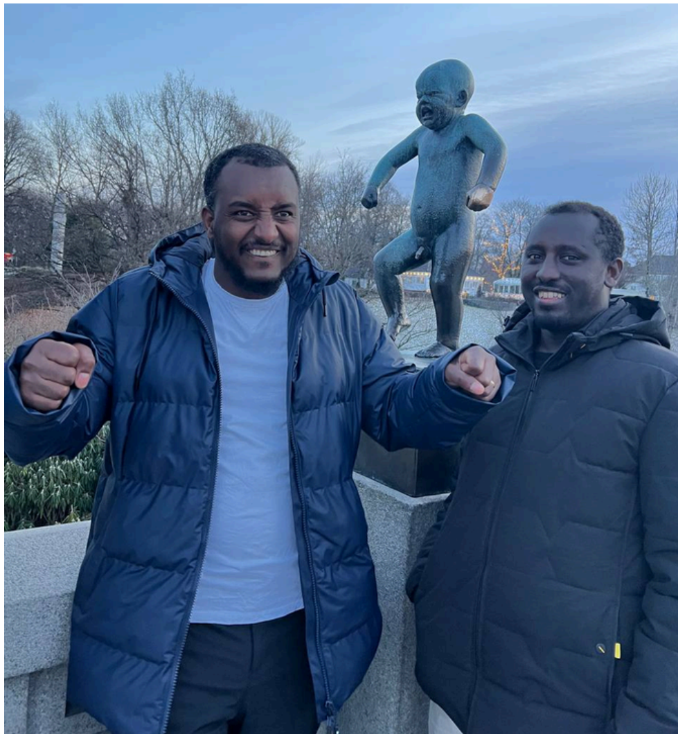
Vigeland Sculpture Park- Oslo

Exploring Oslo with my professors and classmates gave me the chance to learn more about the city's rich history, its blend of old and new architecture, and its vibrant culture. The trip not only deepened my appreciation for Norway but also helped me create lasting memories with the people I was with.