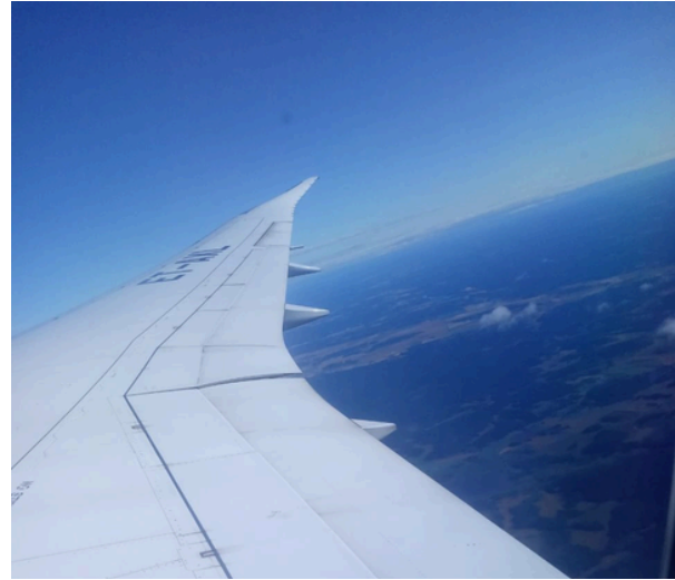
Ethiopian Airline at Stockholm Arlanda Airport

Once we stepped out of the airport, we spent about 30 minutes waiting for our baggage.