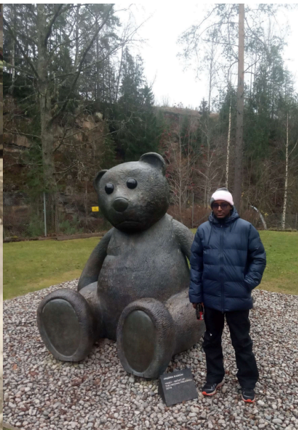
Visit to Kistefos museum