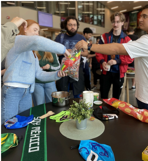
Celebrating global day with international students

One of the highlights of my time in Norway was the celebration of Global Week. During this special event, every student had the opportunity to share and showcase their own culture. It was an amazing experience to see so many different traditions, foods, music, and customs brought together in one place.