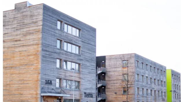
USN Campus Ringerike

This interconnected system eliminates the need for multiple keys or payment methods, offering a streamlined and highly secure experience. The gates across campus are equipped with smart sensors and automated mechanisms, providing seamless access while maintaining security. The classrooms are equally impressive, boasting IoT-driven smart boards, automated lighting, and climate control systems. These features ensure an optimal learning environment, with everything from temperature to lighting being adjustable to suit the needs of the moment. In the cafeteria, IoT systems enable efficient ordering and payment, reducing wait times and improving overall service.