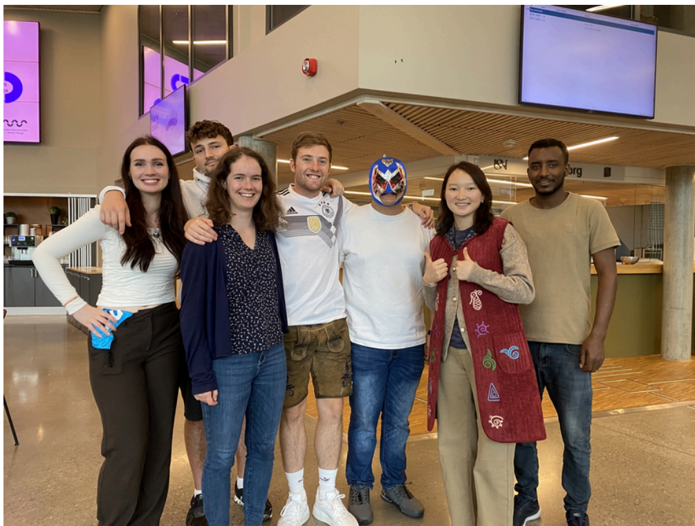
International Students 2024- USN Campus Ringerike