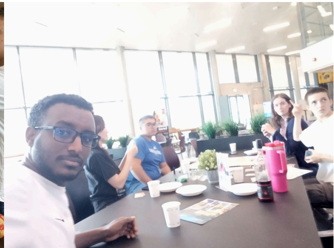
Gathering with international students