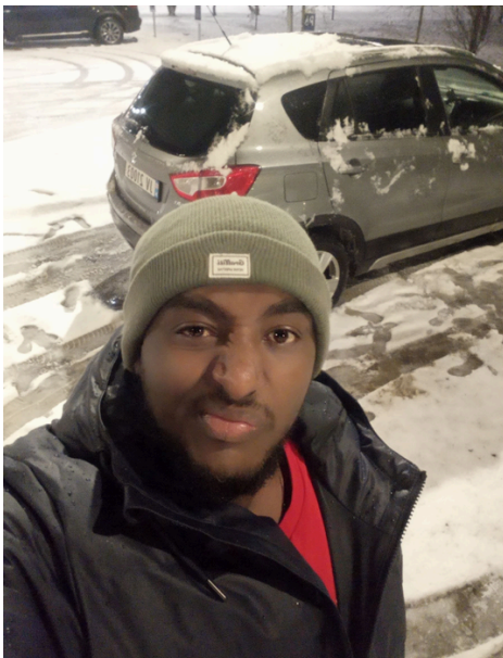
Winter in Hønefoss

These experiences have not only made me more self-sufficient but also more aware of how to adapt to different environments, manage my time, and embrace new cultural experiences.